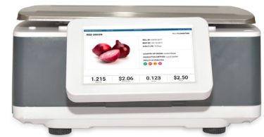
BACK VIEW (CID)